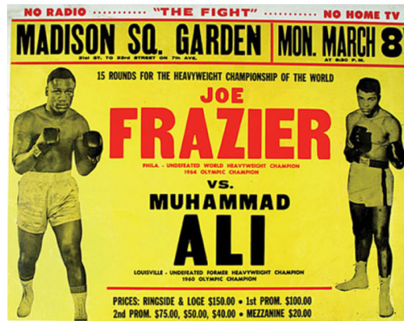
Illinois Golfer Archive (2)

Nobody asked for this now, and few are going