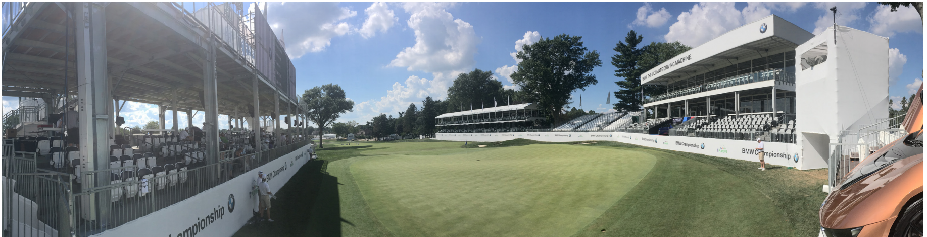
Tim Cronin / Illinois Golfer

EDIFACE COMPLEX There was no shortage of luxury seating around Aronimink's 18th green, but the suites on the left of the photo – the golfer's right on the slight dogleg-right hole – proved too close to the green when several shots clanged off the steel to carom about the premises. Free drops in front of the structure were plentiful.